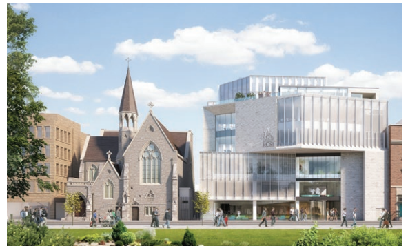
Artist's impression of Project Connect, Dublin.